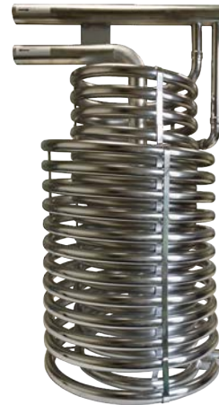
-XHO Unit Heat Exchanger Over 100 Ft. of Coil